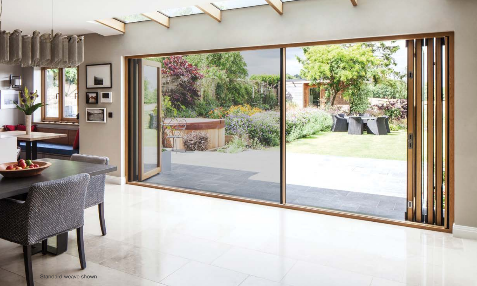
Standard weave shown